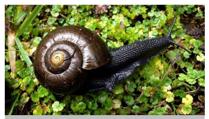
Powelliphanta Snail.

We will monitor the results of the operation by measuring rat numbers before and after the baits have been distributed.