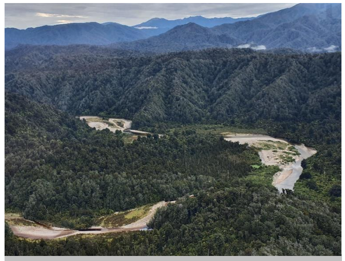
The Heaphy River.