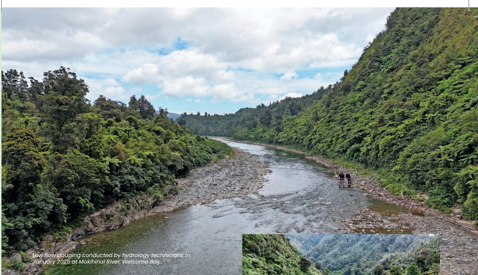
Low flow gauging conducted by hydrology technicians in January 2025 at Mokihinui River, Welcome Bay.