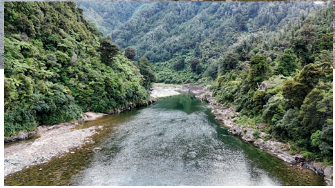
Low flow gauging conducted by hydrology technicians in January 2025 at Mokihinui River, Welcome Bay.