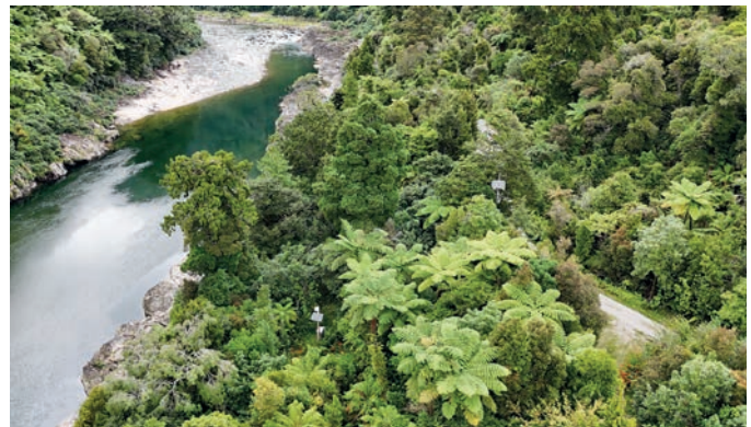
Aerial view of Mokihinui River hydrometric site during low flows with exposed areas of the riverbed.

Relief came with rainfall on February 18–21 and 25, boosting flows across the region. However, despite these increases, most rivers remain below their median annual flow, highlighting how slow recovery can be after prolonged dry conditions.