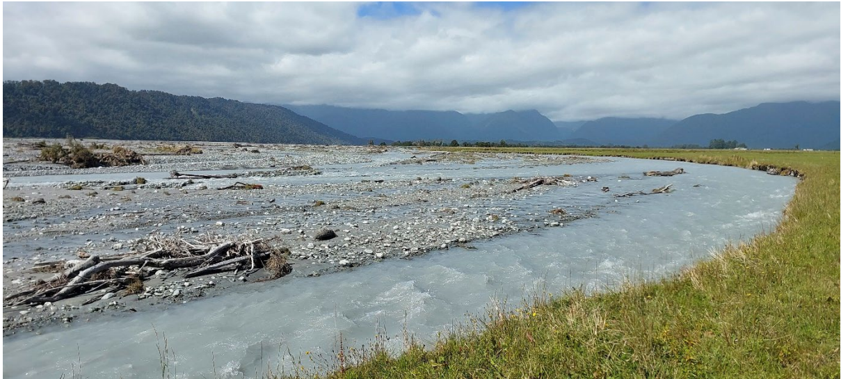
Figure 1 Natural bank erosion beside Todd Brunners property