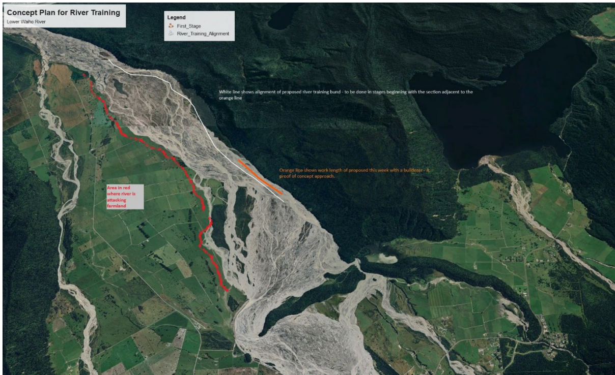
Figure 4: Map of proposed river training from 20th February 2024.