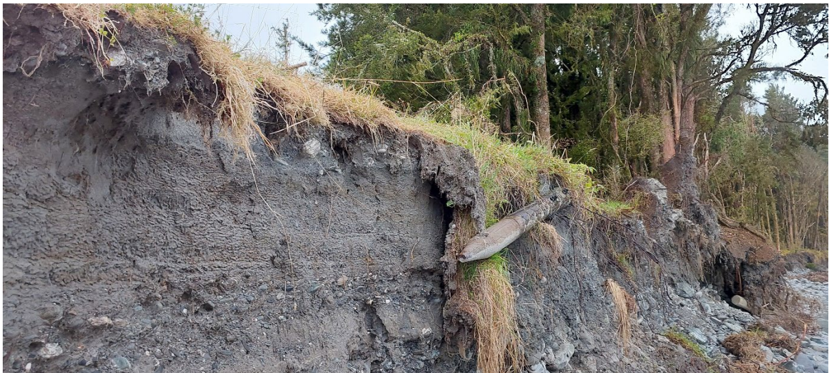
Figure 2: Bank erosion including compromised fencing