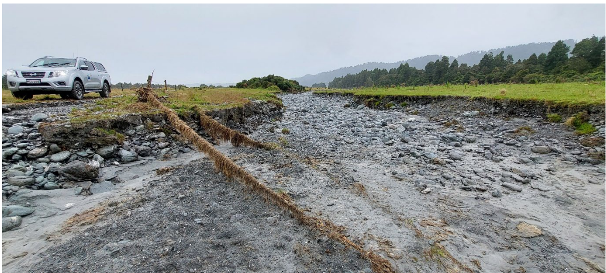
Figure 3: A new, recently formed channel through farmland resulting in scour and erosion. Fencing remnants covered in debris.