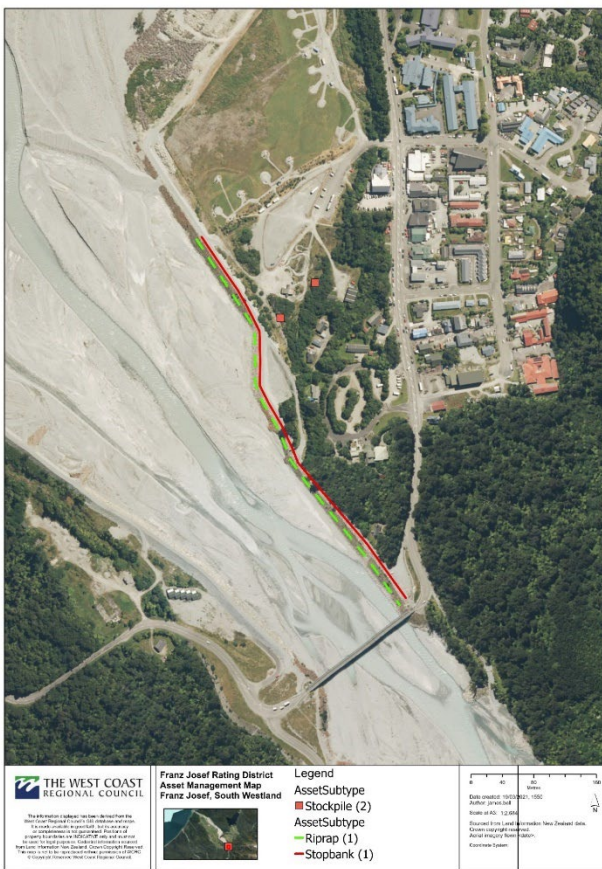
Figure 1: Location of x2 stockpiles (red squares). The stockpile further from the stopbank has not been located on the ground.

The WCRC Asset Database and 2021-24 Asset Management Plan (AMP) for the Franz Josef Joint Committee Rating District identifies two [2] rock stockpiles, one at 1,000 tonnes and the other at 4,300 tonnes: