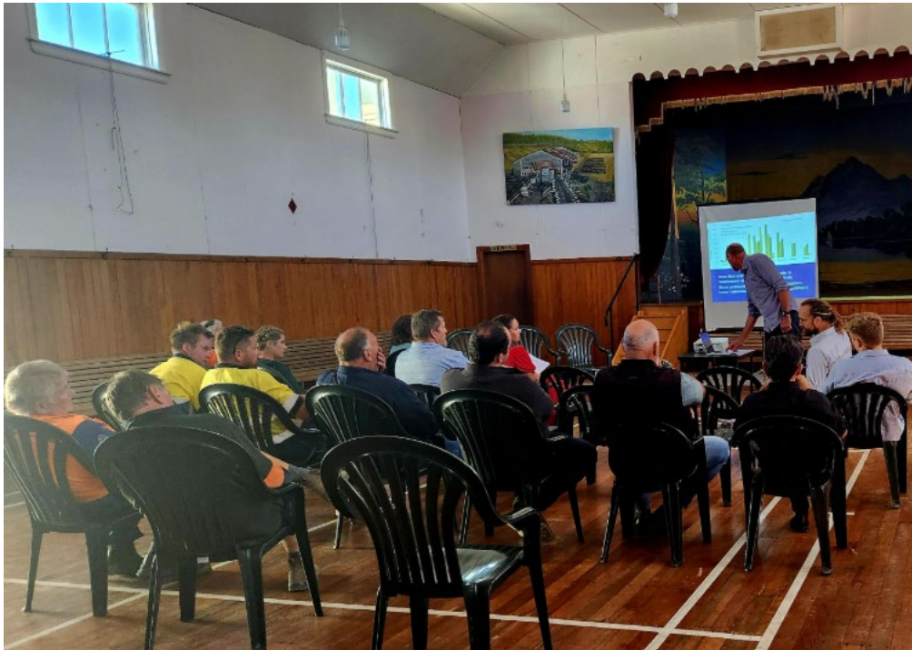
Photo 1: Waimea Catchment Miner's Best Practice Workshop – Kumara – 13 March 2025

The Policy and Regulatory team, alongside the science team delivered an update on freshwater, indigenous biodiversity, and resource management at the Waimea Catchment Miners Best Practice Workshop in Kumara on 13 March 2025. The meeting was a success, facilitating a stronger mutual understanding and promoting collaboration.