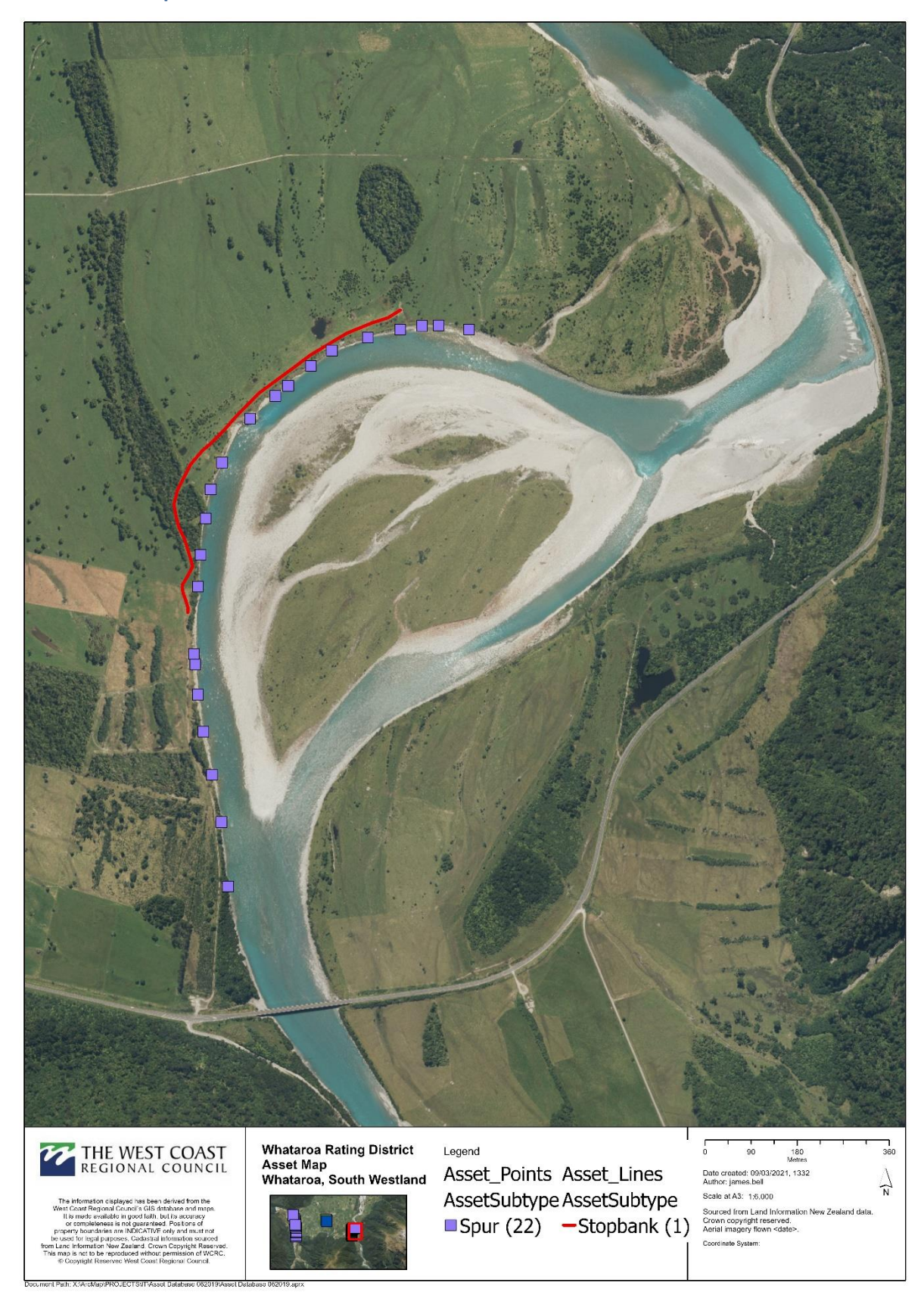
Note: Not all assets have been added to the asset map due to having no spatial data to represent them.